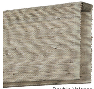
Double Valance inside mount