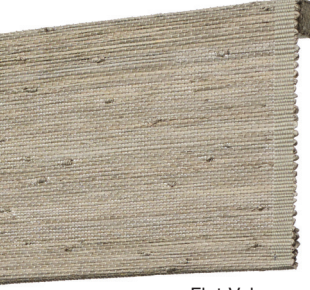
Flat Valance inside mount