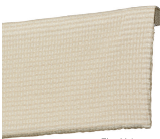
Flat Valance Soft Natural Fabric Collection inside mount