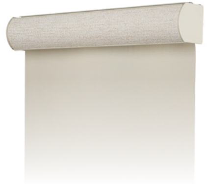
Max. cassette width: 180"