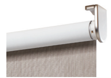
Shown with duplex fabric. Consider reverse roll so top of roll matches the shade body