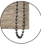
Metal Ball Chain Colors