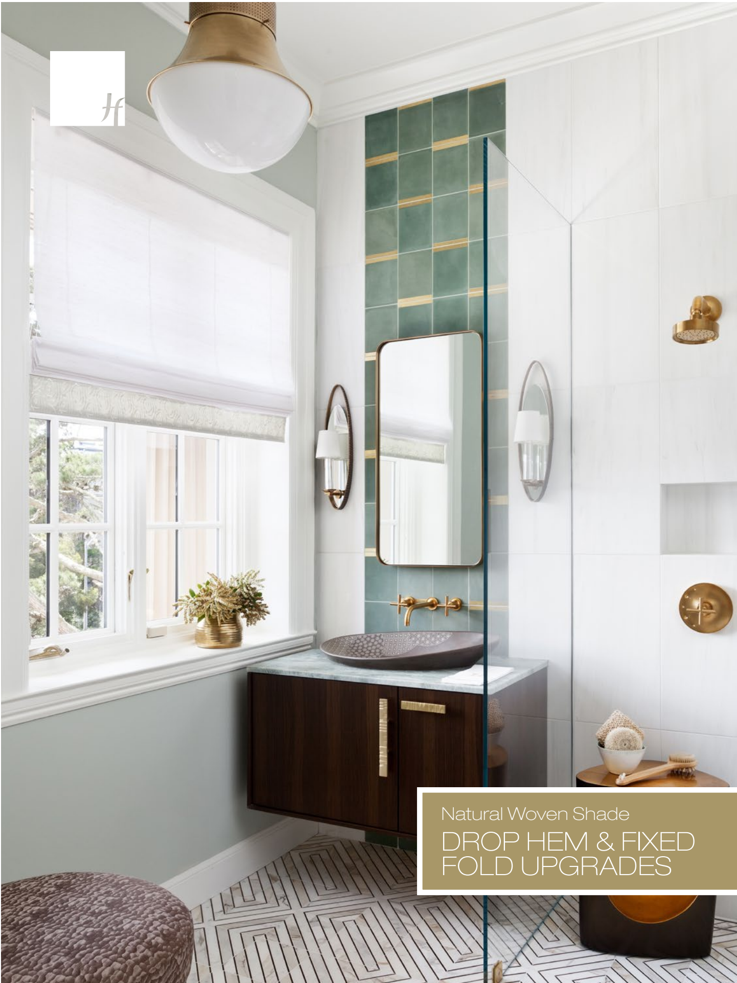
Natural Woven Shade DROP HEM & FIXED FOLD UPGRADES