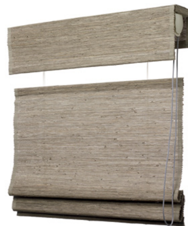
Top-Down Only with Clutch

Size Limitations Max. width: 96" Max. length: over 152" contact H&F