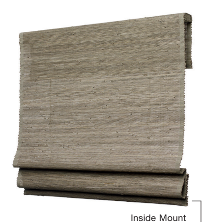
Bottom Hems Woven-to-Size Hand-sewn tapered oval hem Tailored-to-Size