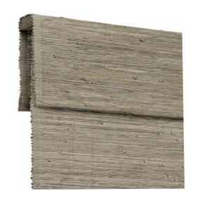
Front Valance Upgrade