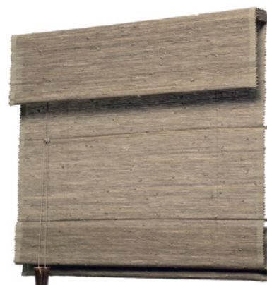
Classic Traditional Style