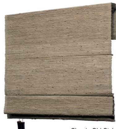
Classic Old Style