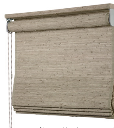
Shown with valance removed

Size Limitations Max. width: 144" Max. length: If over 84" contact H&F