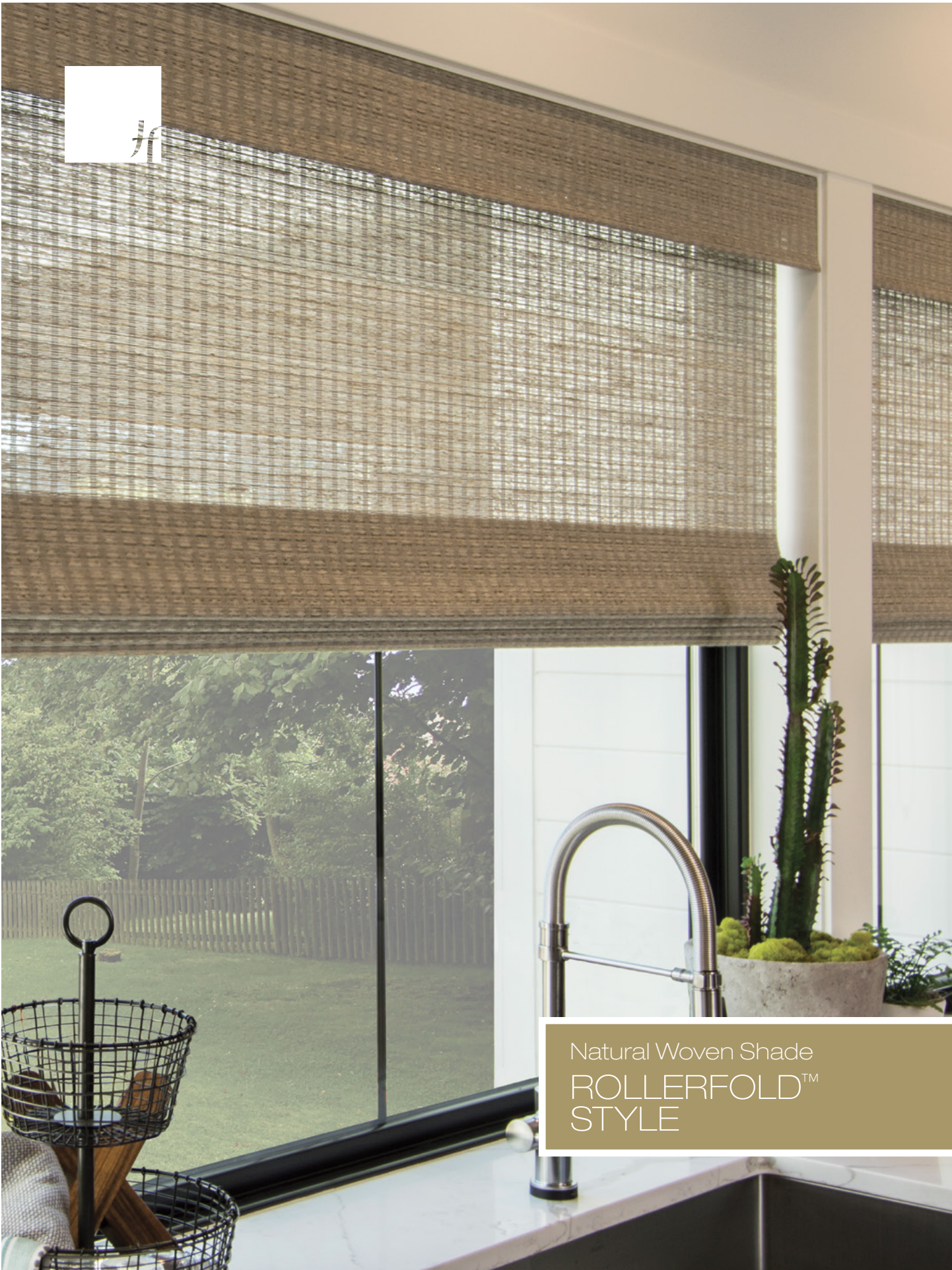
Natural Woven Shade ROLLERFOLD™ STYLE