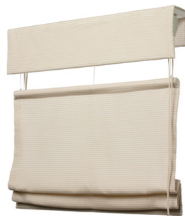
Top-Down Only with Clutch

Size Limitations Max. width: 96" Max. length: 144"