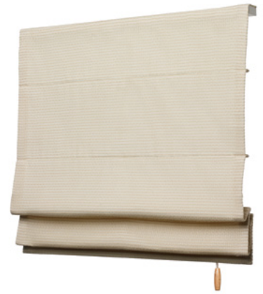
Classic Old Style (outside mount)