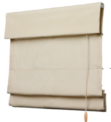
Classic Traditional Style