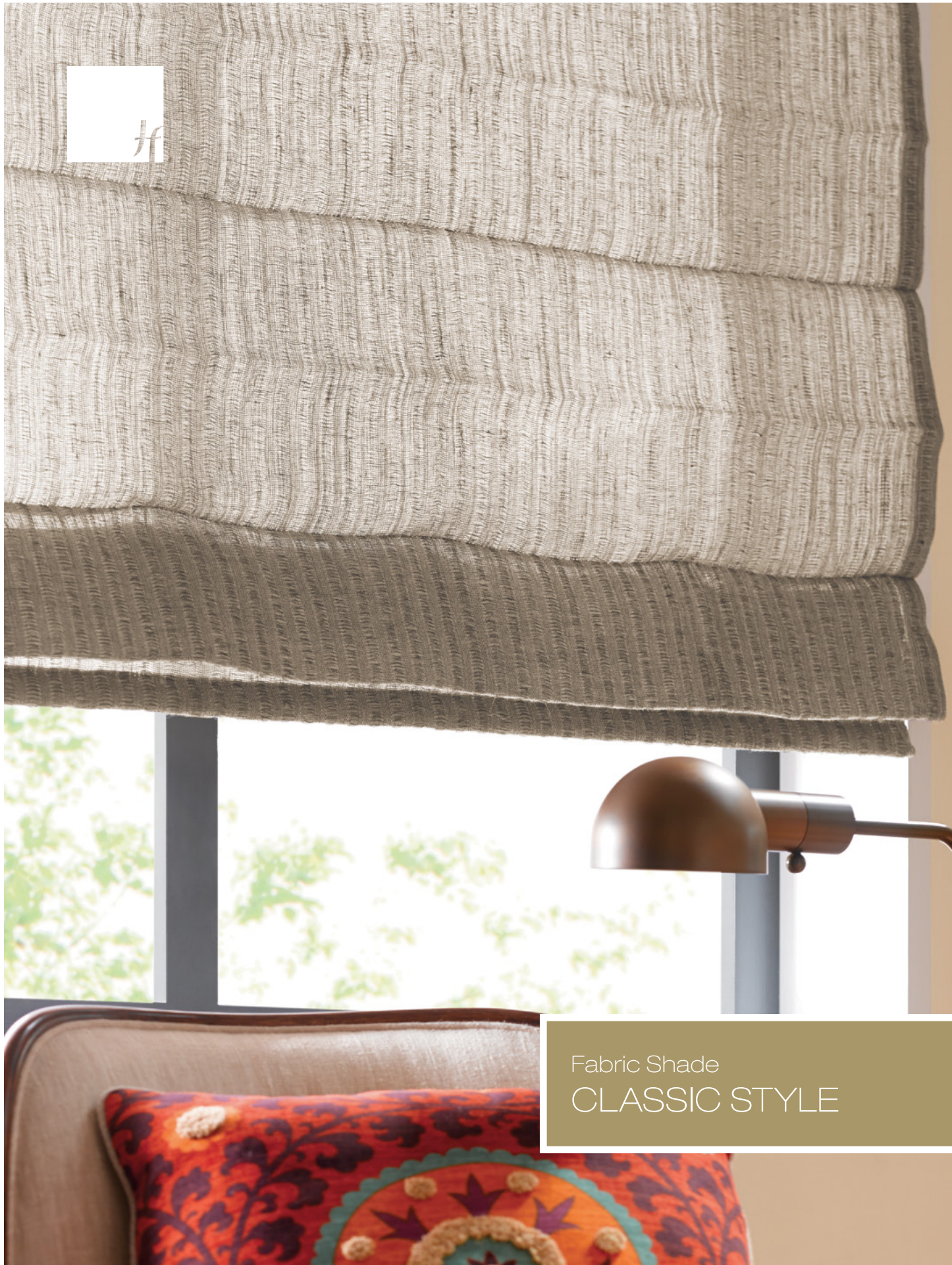
Fabric Shade CLASSIC STYLE