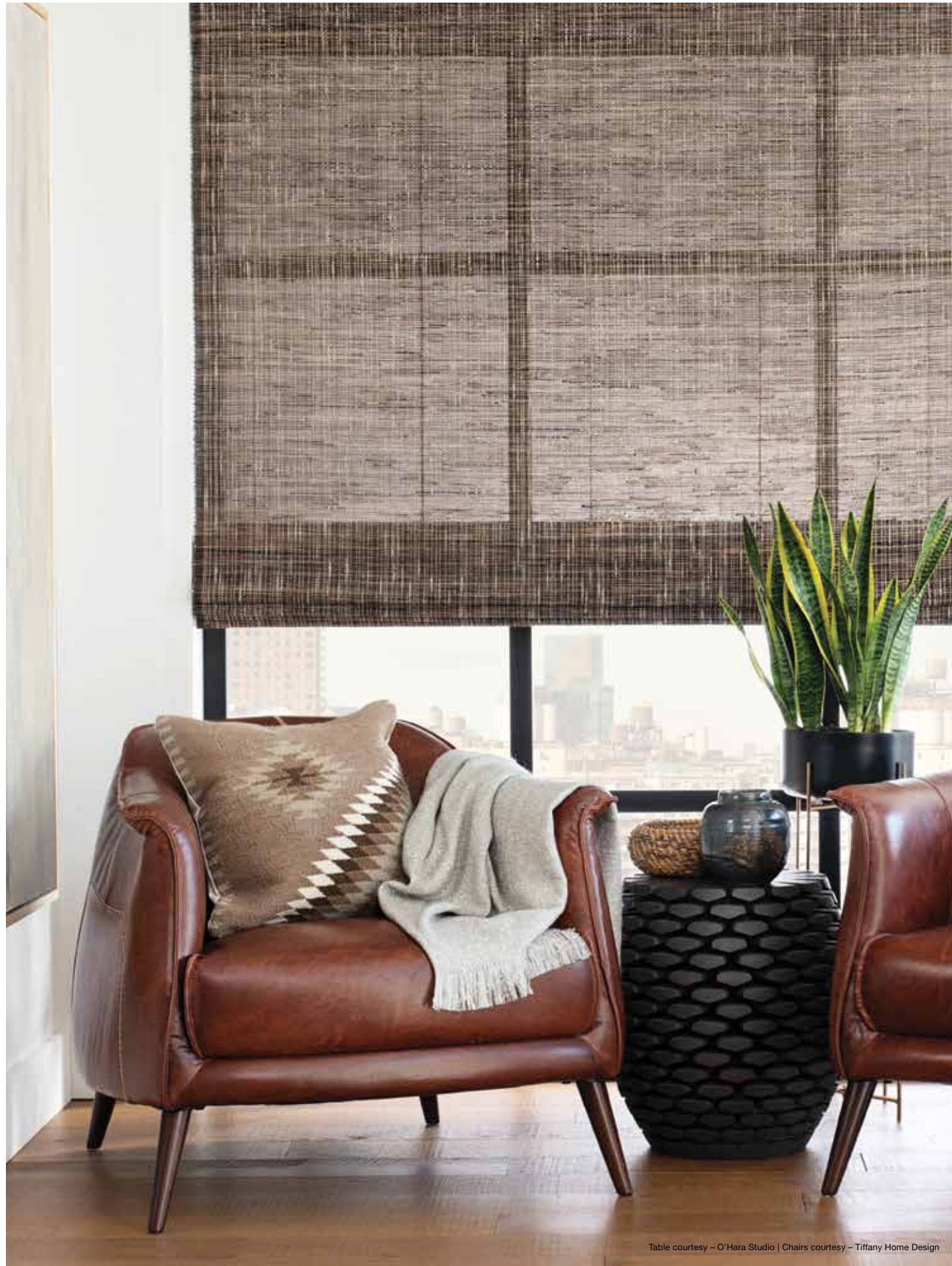
Table courtesy – O'Hara Studio | Chairs courtesy – Tiffany Home Design