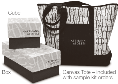
Box Canvas Tote – included with sample kit orders