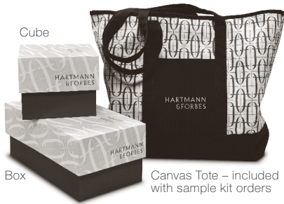
Box Canvas Tote – included with sample kit orders