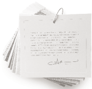
Designer Ring Set