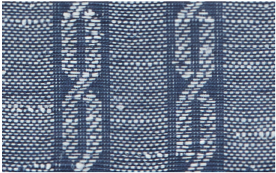
LEMH503-57 Heathered Blue

Reminiscent of iconic New England sweaters, this series is distinguished by its rich dimension rendered on a jacquard hand loom. A dense weave of refined ramie features alternating cable ribs framed in columns. They twist down planes of fabric, imparting visual depth and subtly raised texture in a design at once classic and contemporary.