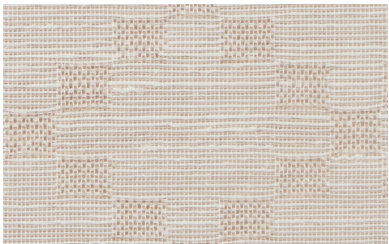
LEMH504-18 Faded Khaki

A modern take on traditional quilts, this series nods to the nostalgia of handmade crafts with its classic chain motif. The geometric pattern and two tonal colors provide a contemporary twist, while jacquard-handloomed ramie creates subtle variations in the weave for rich texture and visual dimension.