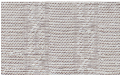
LEMH503-15 Heathered Gray

Window Price Group: 5 | Max Width: 100" Available Styles: Roman, Top Treatment