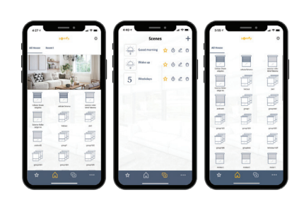
APP, VOICE AND INTEGRATION

TaHoma® is a WiFi bridge that allows you to operate shades while at home or away with a smartphone or tablet. Create custom scenes, schedules and utilize your digital assistant such as Google Assistant and Amazon Alexa.