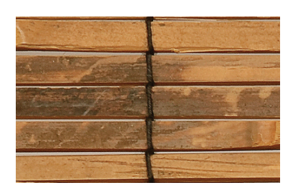
No.31 Taki Caramel