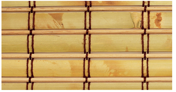
No.25r Bamboo Rustic w/Reed