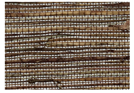
No.90 Kanto Basin