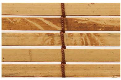
No.31r Taki Rustic

Sustainably cultivated premium bamboo strips are hand laid and woven in a minimalistic pattern offering privacy with style.