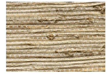
No.92 Mu Basin