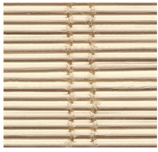
CW09d Sand Dollar