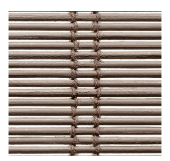
CW36d Park Avenue