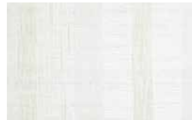
LEAM31-03 Strie Chalk

Bojagi, a traditional Korean silk patchwork that becomes more beautiful and translucent with age, served as the inspiration for this tonal series. Alternating tight and loose weaves, rendered in ramie and warp threads, produce a beautifully irregular striped pattern, and its natural drape and rich texture highlights Gossamer's handwoven quality and the Japanese aesthetic of wabi-sabi.