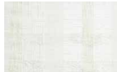
LEAM32-03 Hatch Chalk