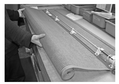
Step 1 Completely lower shade and carefully roll it up from the bottom.

Note: Rollershades should be in their full upright position, completely rolled around tube.