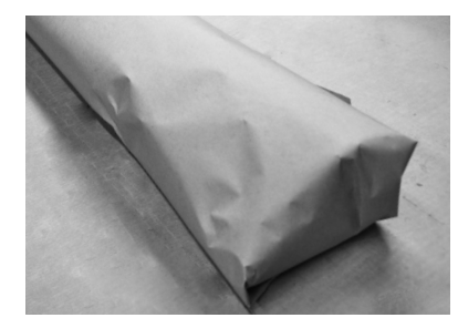
Step 5 Wrap shade in paper.