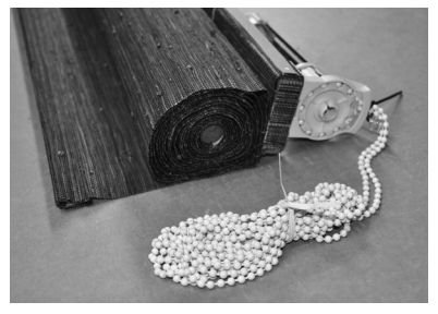
Step 2 If there is a valance, fold it backwards and wrap it around shade. It shouldn't touch the clutch or cordlock mechanism.

Note: Rollershades should be in their full upright position, completely rolled around tube.