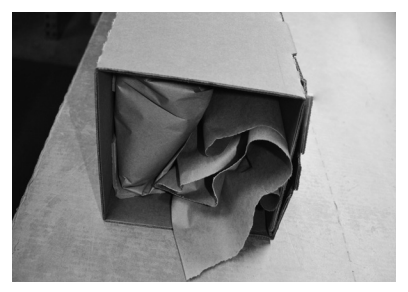
Step 7 Fill any extra space with packing material and close box.