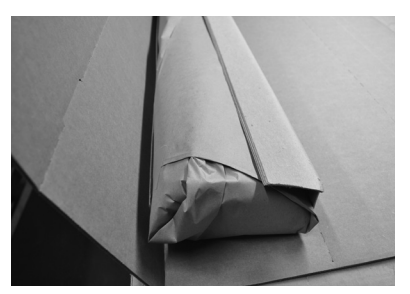
Step 6 Use extra cardboard to create braces on two sides of the shade, tape and put into box.