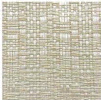
WLB60-06 Bleached Bone