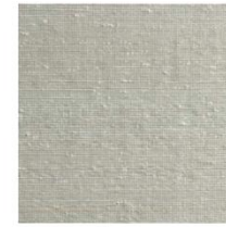
LEBB67-36 Silver Sage