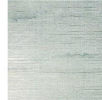
WLB61-32 Aqua Mist