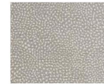
WLB63-36 Silver Sage

All press inquiries, please contact: Jamie Hoffman at Jamie@spread-communications.com or 201-400-8512