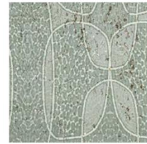
WLB62-32 Cast Glass