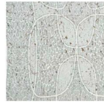
WLB62-36 Silver Mist