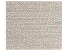
WLB63-32 Blanc de Chine