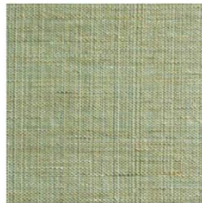
LEBB65-32 Spring Rain