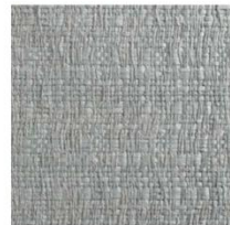
WLB60-32 Blanc de Chine