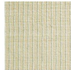
LEBB66-33 Silver Lake