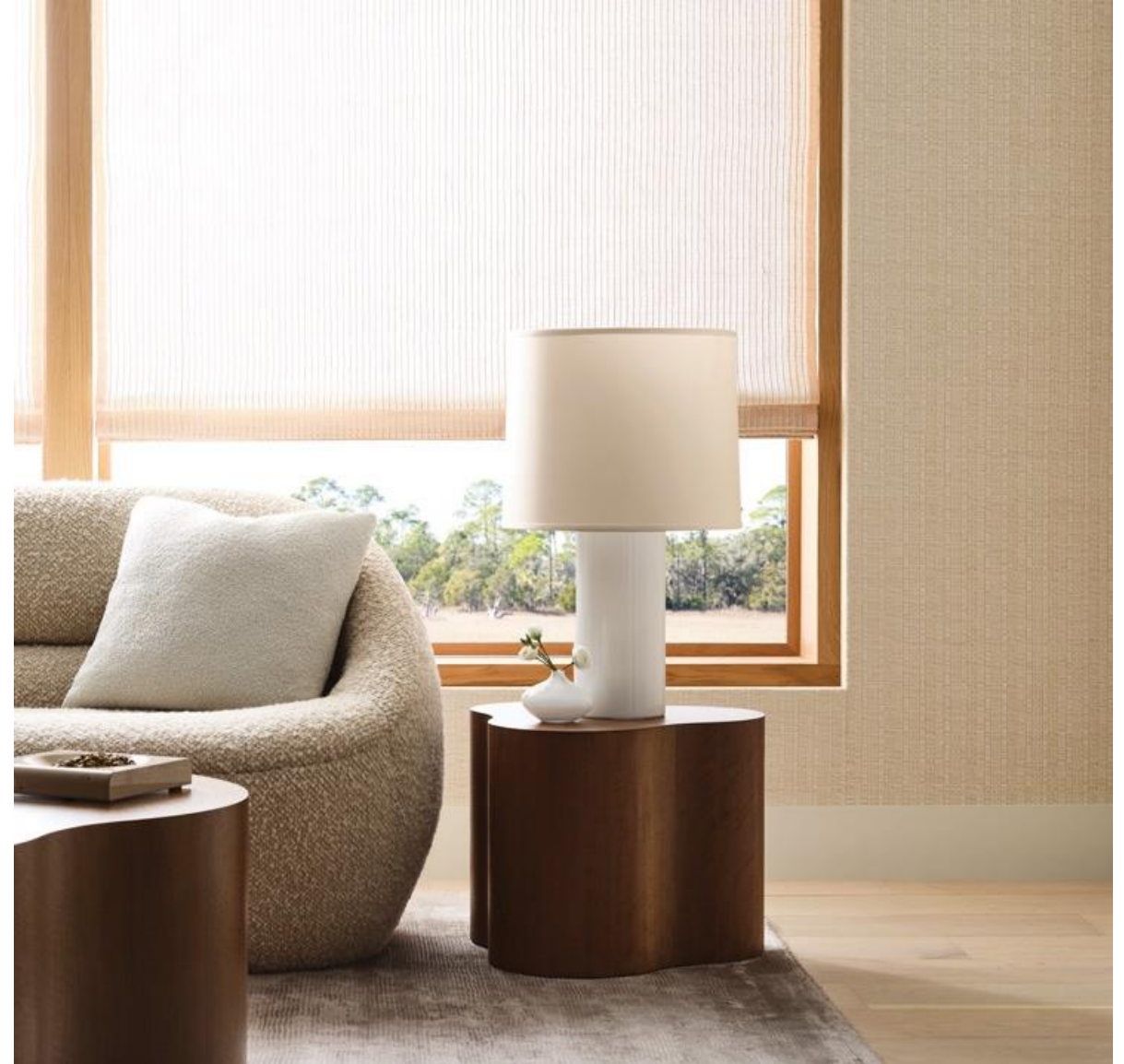
WOVEN-TO-SIZE GRASSWEAVE WINDOWCOVERING

All press inquiries, please contact: Jamie Hoffman at Jamie@spread-communications.com or 201-400-8512