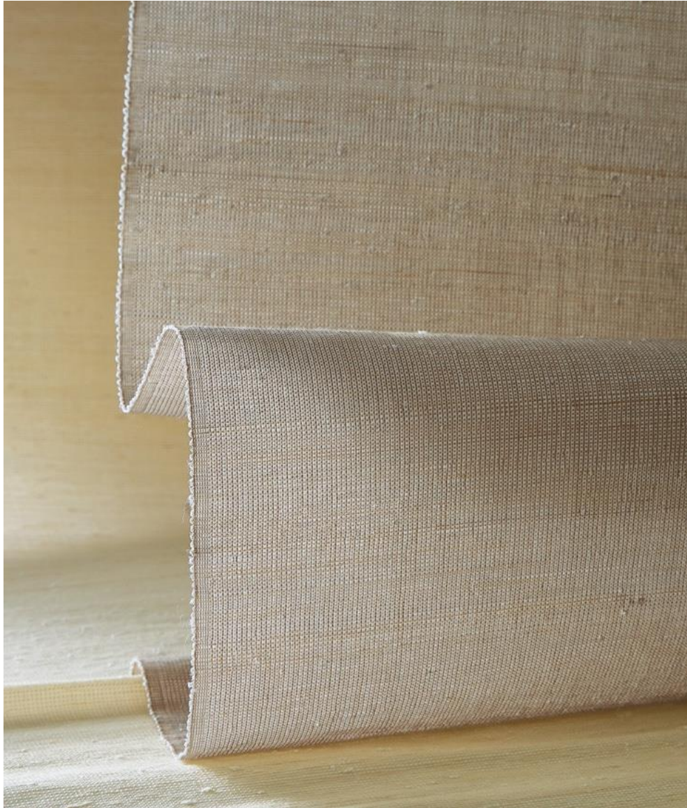
WOVEN-TO-SIZE GRASSWEAVE WINDOWCOVERING

Delicately woven by hand from ramie and lustrous banana fibers, this elegant windowcovering has just a hint of color and softly lets the light retreat.