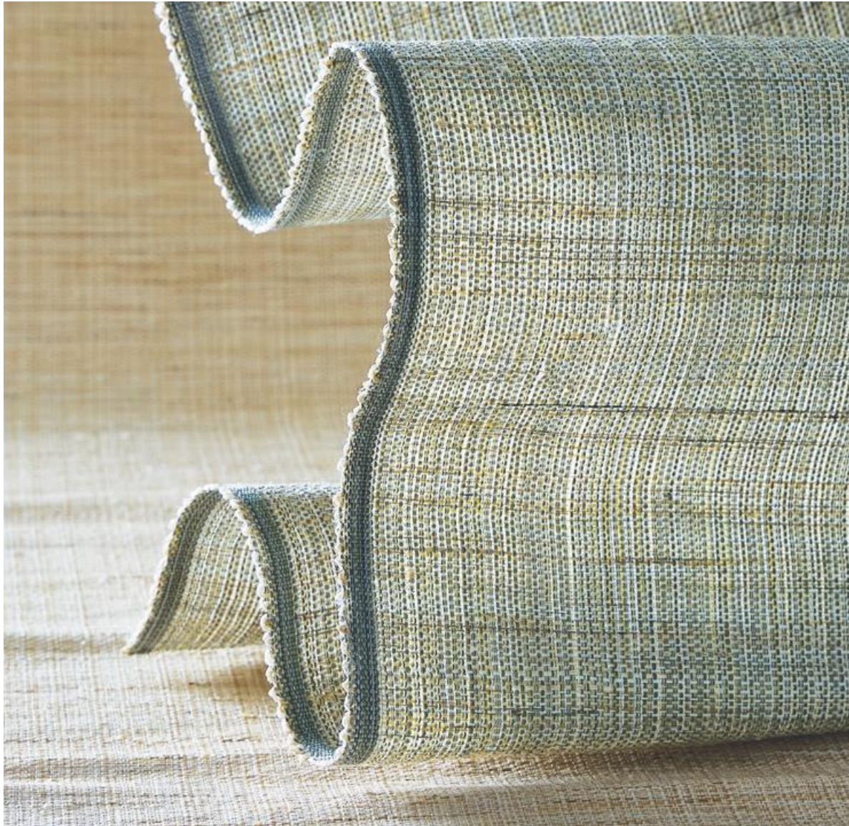
WOVEN-TO-SIZE GRASSWEAVE WINDOWCOVERING

Handwoven in a crosshatch pattern of natural fibers, Repose is a beautiful, textural windowcovering with a natural dimension. The two colorways — Spring Rain and Raffia — reference the sky and earth.