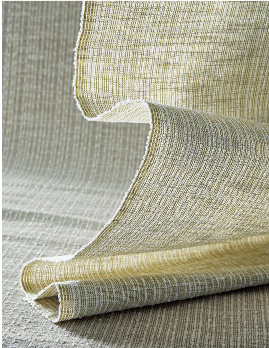
WOVEN-TO-SIZE GRASSWEAVE WINDOWCOVERING

Handwoven from natural Ramie, Cirrus' twisting, ladder-like warp thread creates a boudé texture that adds a touch of sheen to the windowcovering.