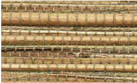
No.13m Morning Prairie Max Seamless Width: 96"