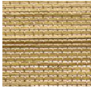
No.91p Palm Linen PG3