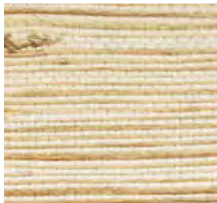
No.93 Yangtze Basin

Elegant and finely tailored, this weave offers quiet serenity and soothing tones of sandstone, dappled grey and cocoa brown.