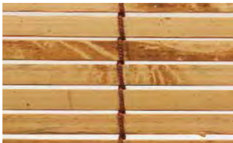
No.31r Taki Rustic