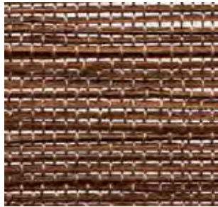
No.91r Russet Linen PG4