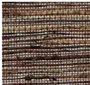
No.90 Kanto Basin