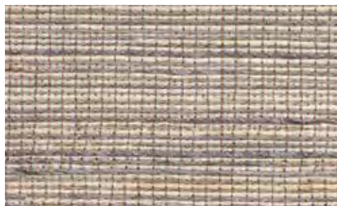
KW92 Pacific Basin