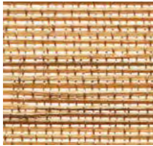
No.91s Summer Linen PG3

Crisp, minimal and delightfully modern, this series has the natural approachability of linen fabric. Offered in a full color palette to complement a wide range of interior color schemes.