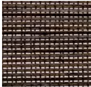
No.91d Dusk Linen PG4