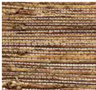
No.98 Fuji Basin