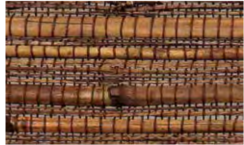
No.13s Shadow Prairie Max Seamless Width: 96"

A prairie landscape of light and dark shading is translated into a jute weave interspersed with wild river reeds.