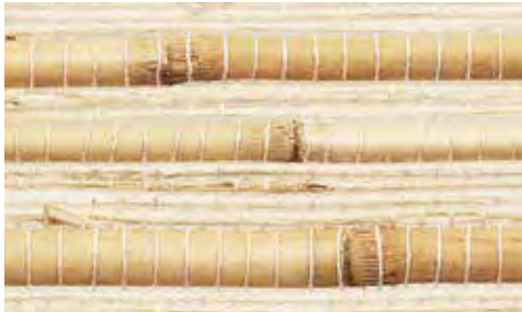
No.13n Natural Prairie Max Seamless Width: 96"