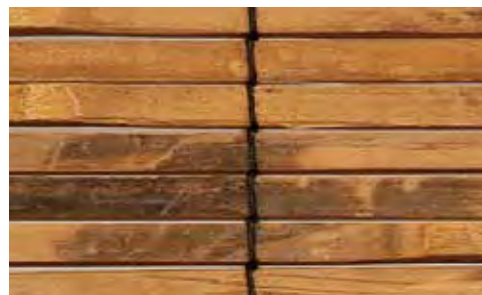
No.31 Taki Caramel