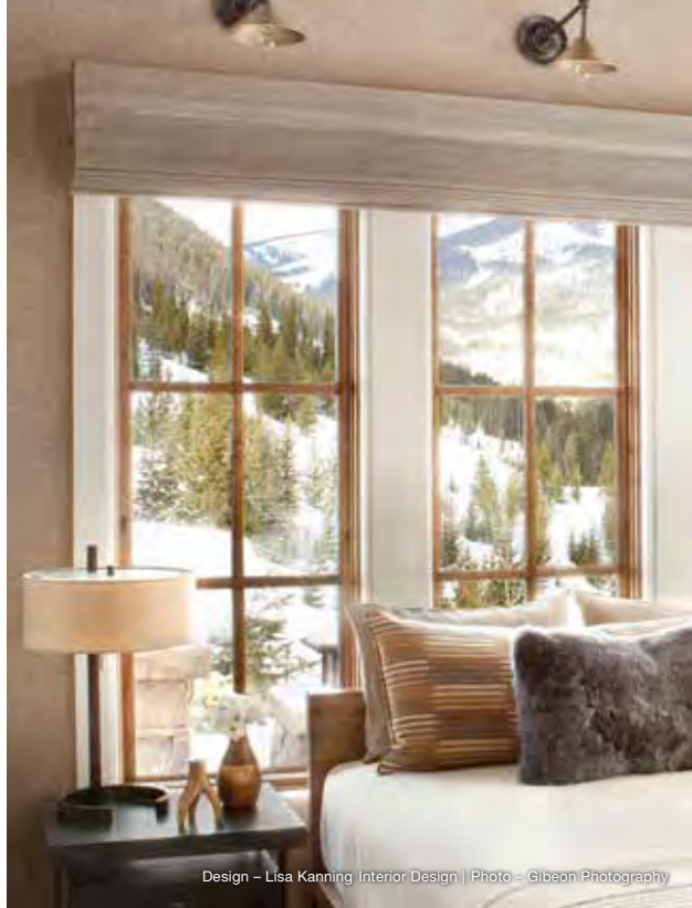
Design – Lisa Kanning Interior Design | Photo – Gibeon Photography