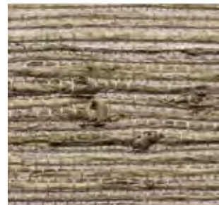
No.95 Saru Basin