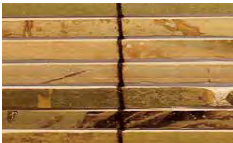
No.31s Taki Shell