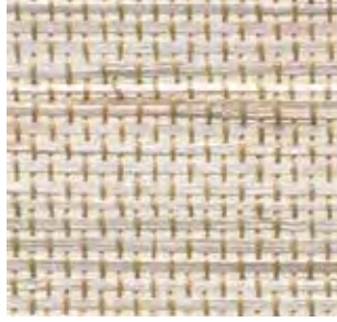
No.91w Winter Linen PG4