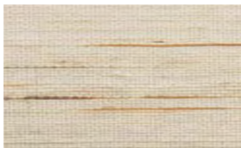
KW95 Lotus Blossom