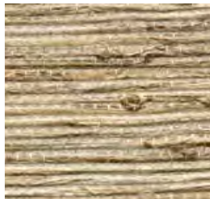
No.92 Mu Basin