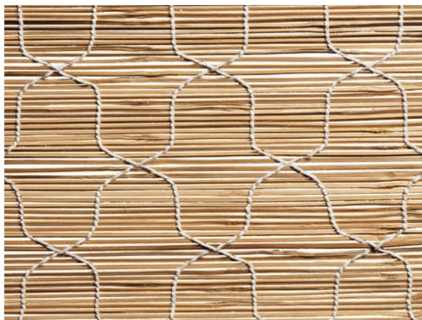
CW90 Bambosa Cream