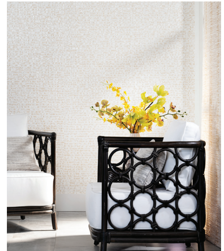
WL424-06 Baja – Coral Sands