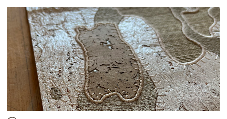
3 Leaving a finished edge