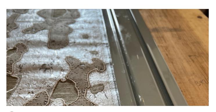
2 Using a sharp cutting blade, trim 1/8"-1/4" from vertical stitching