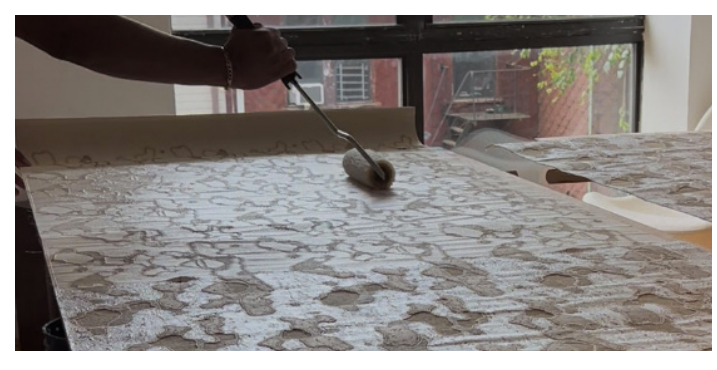
Apply appropriate paste evenly, especially near edges, to the back of the wallcovering, taking care not to get adhesive on face of wallcovering. Allow wallcovering paste to become tacky prior to hanging – timing will vary depending on the temperature and humidity of the room.