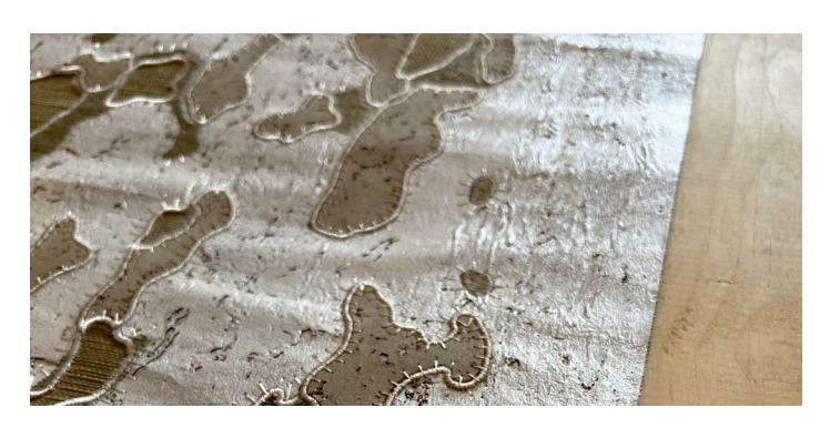
1 Sycamore has a selvage edge and will need to be trimmed.