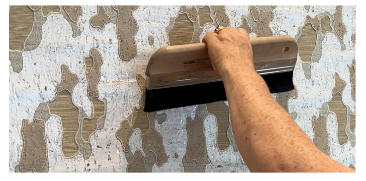
Using a brush or roller, smooth out the wallcovering as it adheres to the wall.

If you have any questions before, during or after installation, please contact Customer Relations at 888.582.8780 or at hfcr@hartmannforbes.com