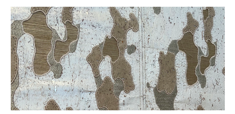
(5) Align pattern as you hang wallcovering with panels side-by-side, noting the "TOP" of each panel.