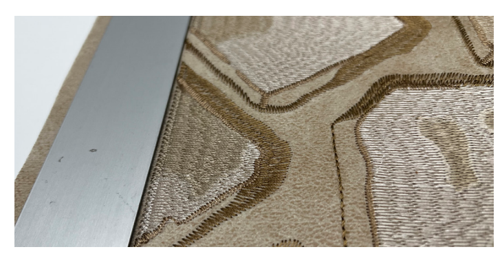
2 Using a sharp cutting blade, trim along edge of embroidery pattern.