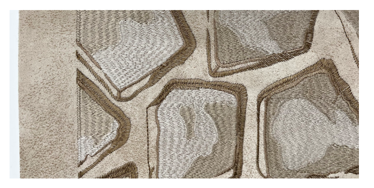
1 Rocks has a selvage edge and will need to be table trimmed.

WLLK48-18 Rocks – Topaz WLLK48-60 Rocks – Pyrite