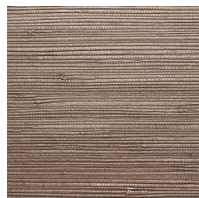
WL417-45 Peninsula - Beach

Order no-charge memos online at hartmannforbes.com or contact your local representative showroom.