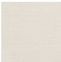
EC200-06 ECO 200 - Calcite