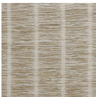
LE6215 Genesis - Grainseed