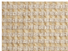
EW400-12 Honeycomb – Clove