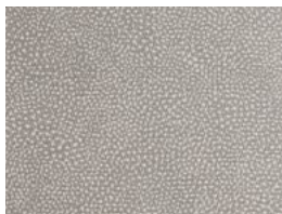
WLBB63-32 Transcendence – Blanc de Chine