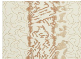
WLLK541-06 Delos – Ammou