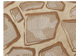
WLLK48-18 Rocks – Topaz

Order no-charge memos online at hartmannforbes.com or contact your local representative showroom.