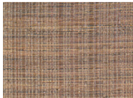
LELK41-21 Cenote – Oro