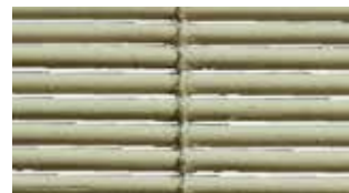
CW75 Citron NEW