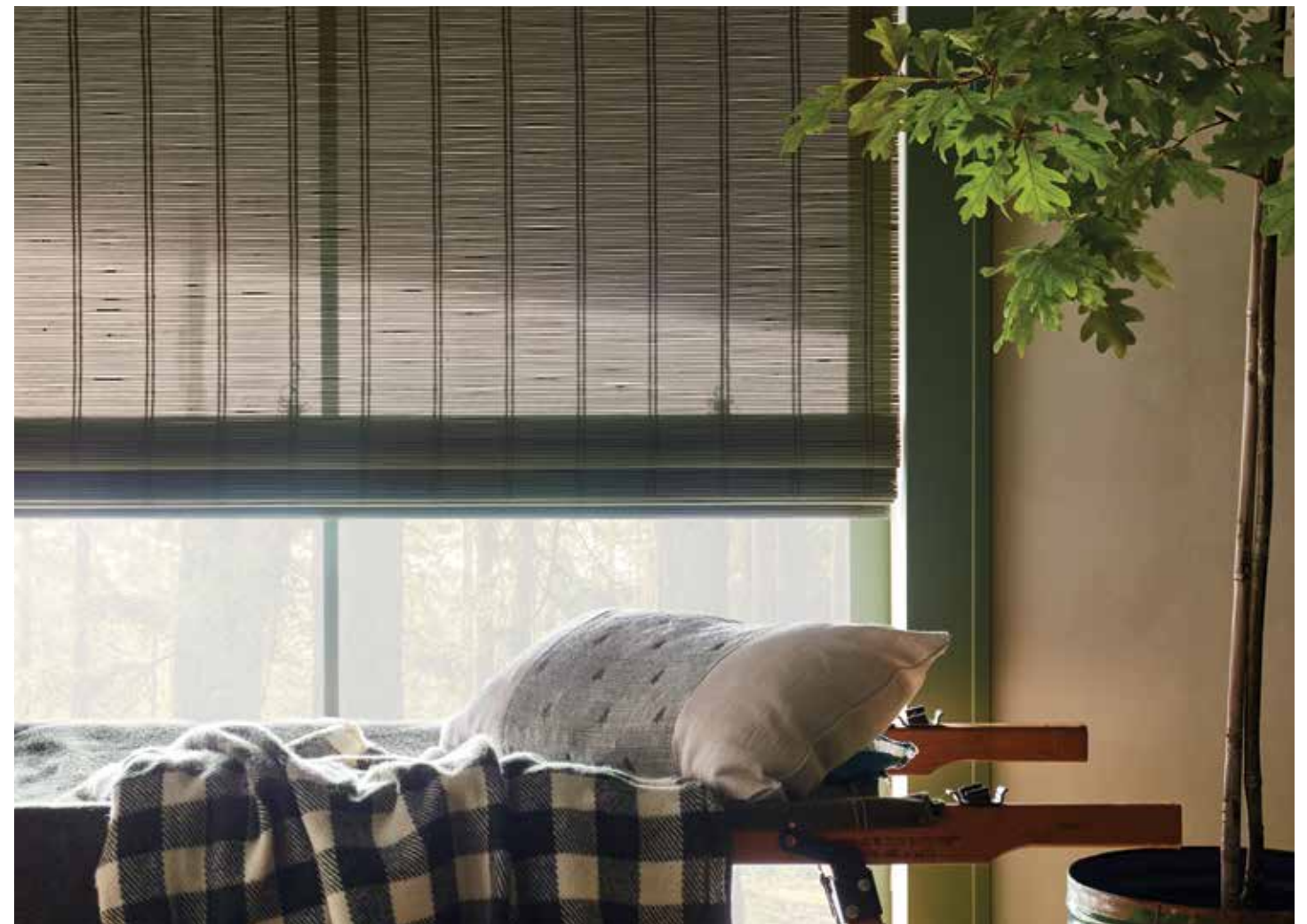
Shown: Modern Colourweave in custom color match

Custom painted to order in modern and traditional matchstick patterns to match a room's colors, furnishings or cabinetry.