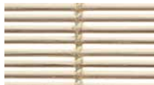
CW09 Sand Dollar