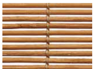
CW45 Bolivian Maple