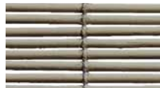
CW73 Zion NEW