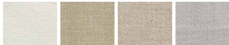
906 Naturale 927 Corda 912 Lino 936 Ostrica