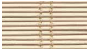
CW09d Sand Dollar