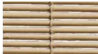
CW74 Sierra NEW