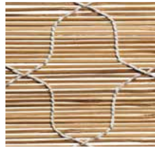
CW90 Bambosa Cream

This boldly textural design not only celebrates but elevates the imperfect beauty of natural materials.