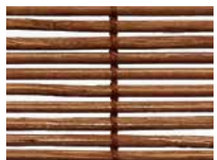
CW47 Brazilian Teak