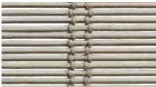
CW73d Zion NEW