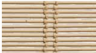
CW74d Sierra NEW