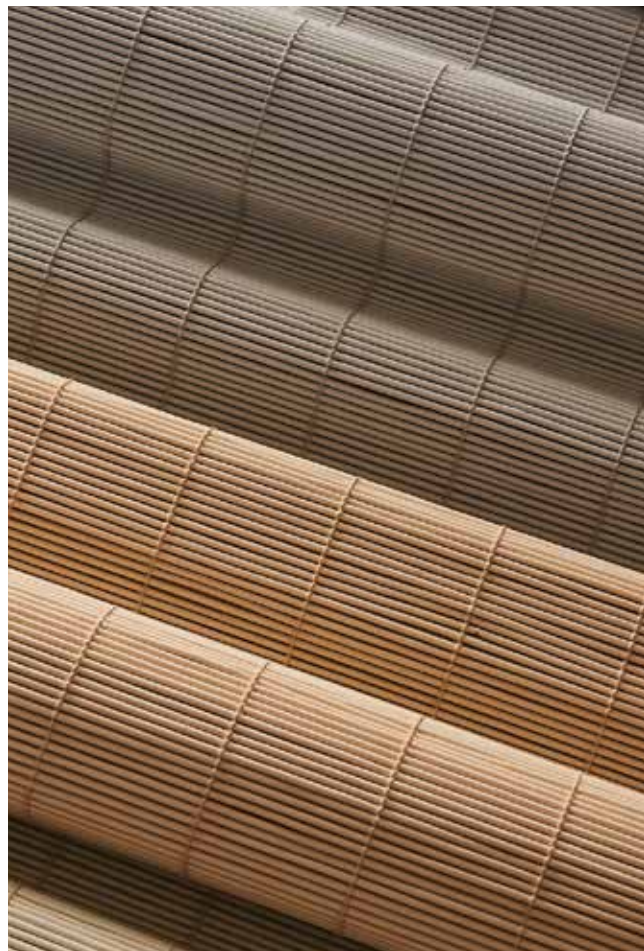
Price Group: 2 | Max Width: 96" Available Styles: Roman, Top Treatment