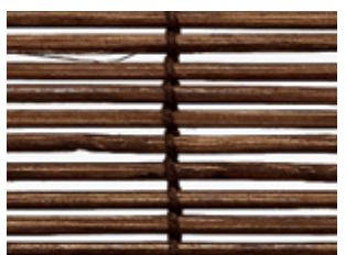
CW46 Peruvian Walnut