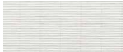
CWMS83 Shiro NEW