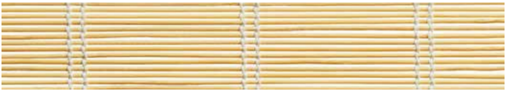
CW00d Natural NEW

A handcrafted double warp updates this traditional weave to a clean contemporary aesthetic. Woven with sustainably sourced bamboo, this design makes a crisp architectural statement.