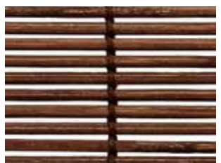
CW48 Chilean Cherry