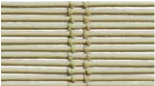
CW75d Citron NEW

Price Group: 2 | Max Width: 120" Available Styles: Roman, Top Treatment