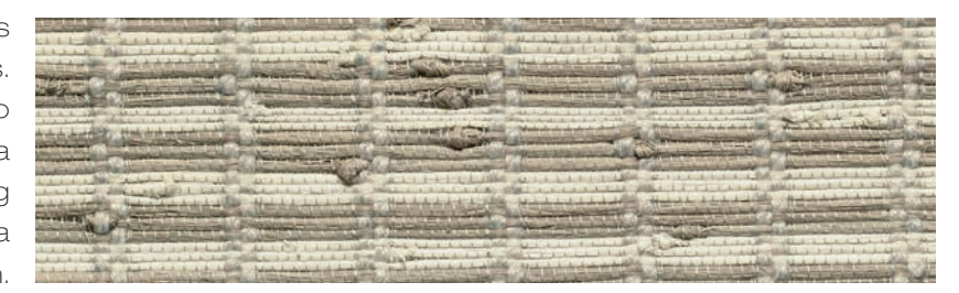
Price Group: 5 | Max Width: 180" Available Styles: Roman, Top Treatment

A thick warp of double-twisted palm yarns yields a textural landscape that conjures traditional Japanese mats. Hand-knotted fibers in two earthy colors combine to form a tonal grid pattern, while allowing light to pass through like a dimensional screen.