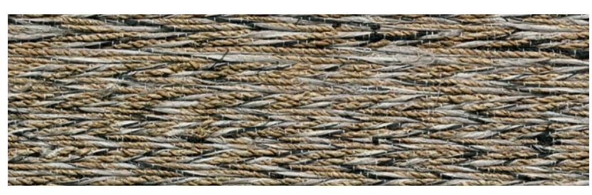
Price Group: 5 | Max Width: 120" Available Styles: Roman, Top Treatment

LE4715 MELANGE A multi-hued mix of fibers marks the Melange design. Ramie, palm, and black abaca are skillfully twisted together to evoke the heathered look of eagle feathers. The weave - distinctive and dense – combines natural colors to create a slanted, impressionistic pattern.