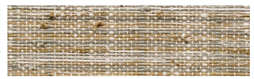
Price Group: 4 | Max Width: 180" Available Styles: Roman, Roller, Top Treatment