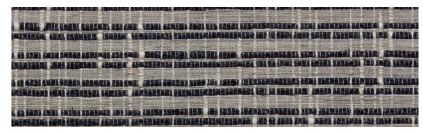
Price Group: 5 | Max Width: 180" Available Styles: Roman, Top Treatment