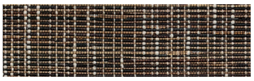
Price Group: 5 | Max Width: 180" Available Styles: Roman, Roller, Top Treatment

Lending a vibrant and earthy uptake on midcentury modern, this upbeat and textural design of abaca fiber is complemented with hand-placed water hyacinth and a continuous warp thread of woodsy neutrals.