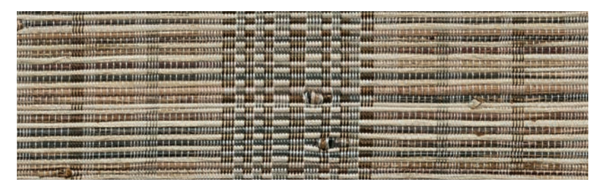
Price Group: 5 | Max Width: 180" Available Styles: Roman, Top Treatment

Defined by distinctive plaid stripes enriched with an intricate check pattern adding depth and definition against a beige backdrop, Havana is loomed with hand-placed fibers of black abaca and thick, textural ramie. The sensibility is at once relaxed and tailored.