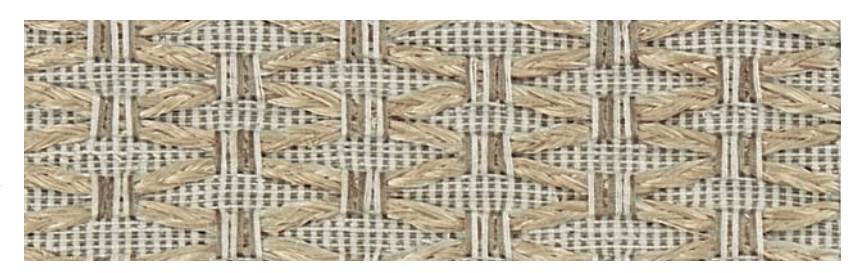
Price Group: 5 | Max Width: 100" Available Styles: Roman, Top Treatment