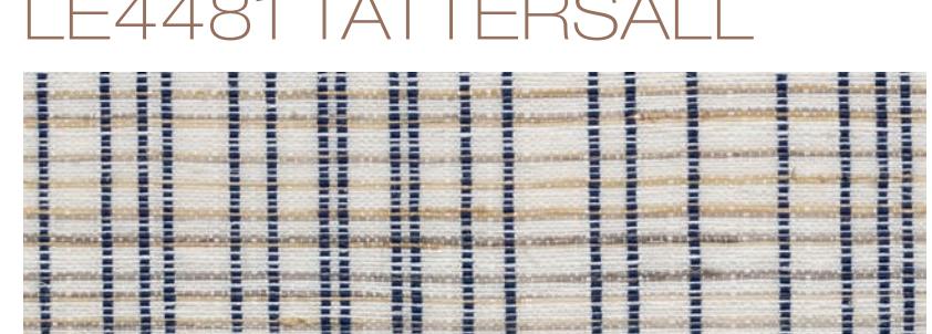
Price Group: 4 | Max Width: 180" Available Styles: Roman, Roller, Top Treatment

Created in honor of the historical 18th century Tattersall blanket pattern, this modern perspective is composed of interwoven indigo warp threads and ramie, highlighting strong vertical lines with contrasting neutrals.