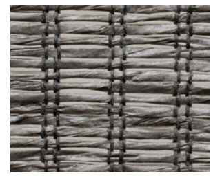
PE604-60 Vibrant Grey