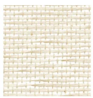
PE600-03 Pure White

This linen-like weave lends quiet sophistication to a room with its exquisite refinement. Invitingly soft and supple, it comes in an elegant spectrum of hushed neutrals from Pure White to Steady Graphite.