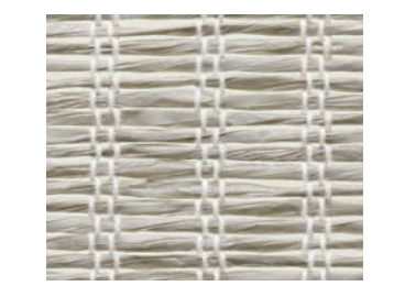
PE604-36 Contented Grey