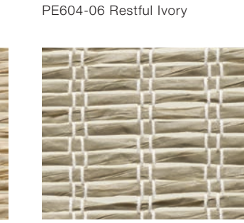
PE604-30 Peaceful Green