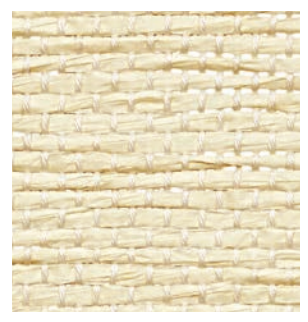
PE600-06 Sacred Desert