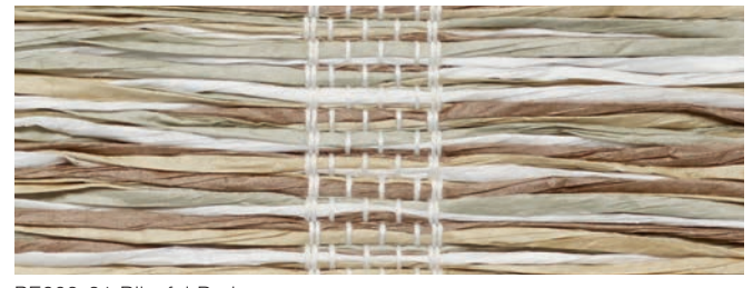
PE603-21 Blissful Bark