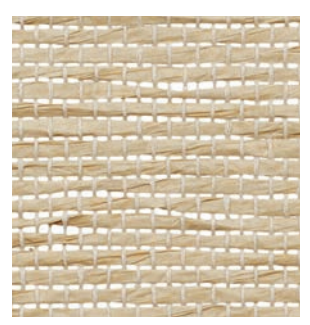
PE600-09 Serene Sand