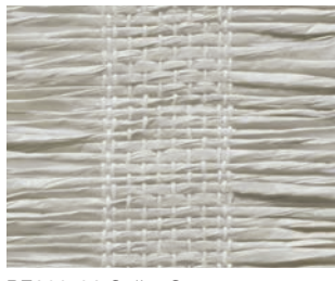
PE603-36 Sulky Grey