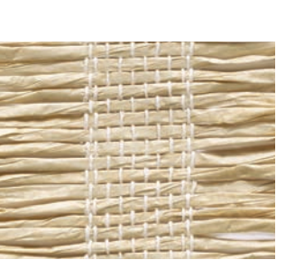
PE603-09 Creative Sand