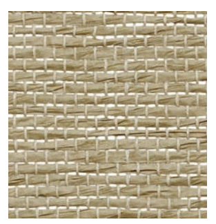
PE600-30 Wise Sage