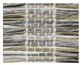
PE603-63 Warm Slate