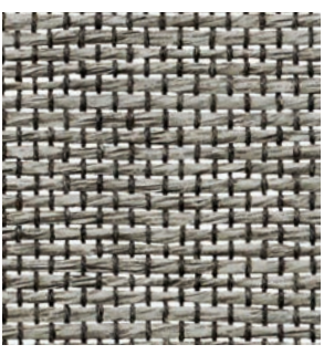
PE600-60 Steady Graphite