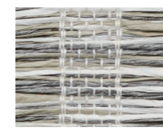
PE603-15 Kind Grey