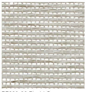
PE600-36 Placid Grey