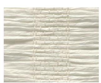
PE603-03 Calm White