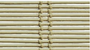
CW75d Citron NEW