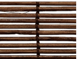
CW46 Peruvian Walnut