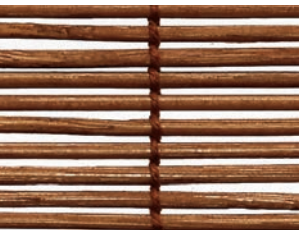
CW47 Brazilian Teak