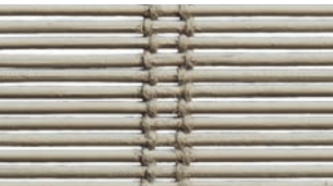
CW73d Zion NEW