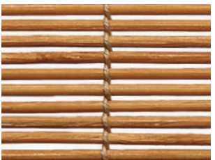
CW45 Bolivian Maple