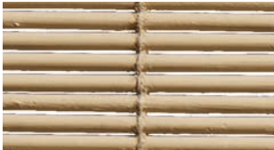
CW74 Sierra NEW PG2