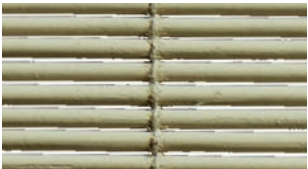
CW75 Citron NEW PG2