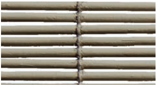
CW73 Zion NEW PG2