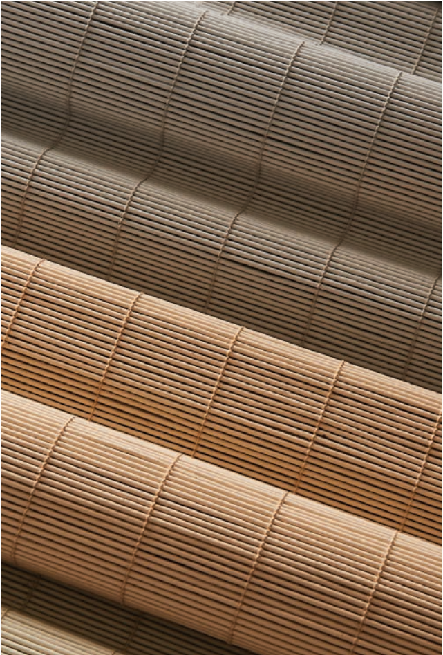
Price Group (PG): 1, 2 | Max Width: 96" Available Styles: Roman, Top Treatment