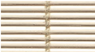
CW09 Sand Dollar PG2