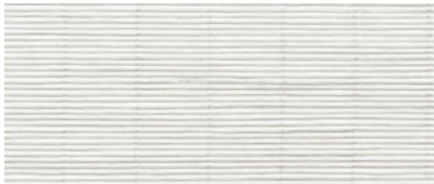
CWMS83 Shiro NEW