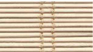
CW09d Sand Dollar