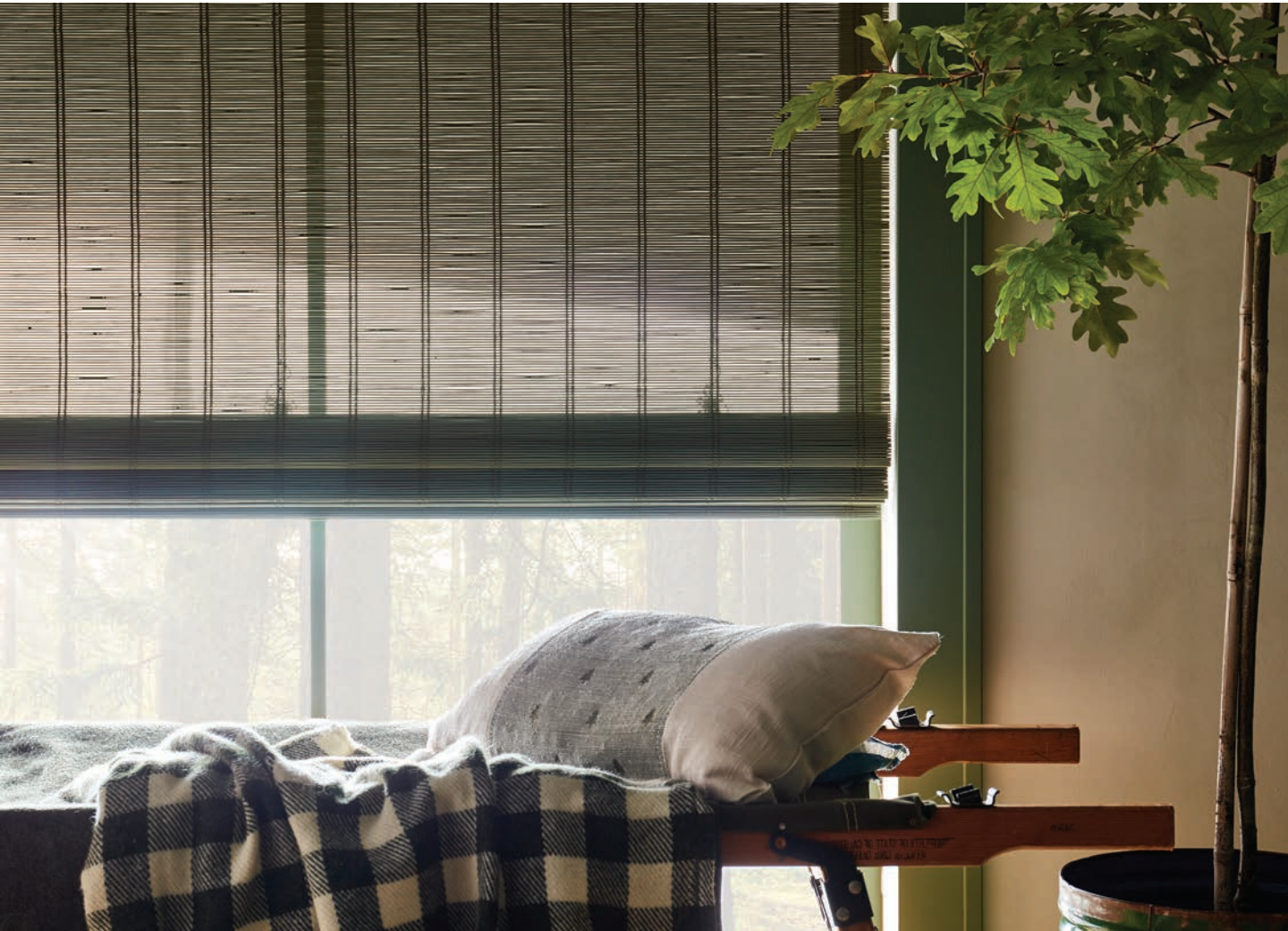
Shown: Modern Colourweave in custom color match

Custom painted to order in modern and traditional matchstick patterns to match a room's colors, furnishings or cabinetry.