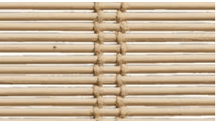
CW74d Sierra NEW