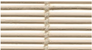
CW29 Quartz PG2