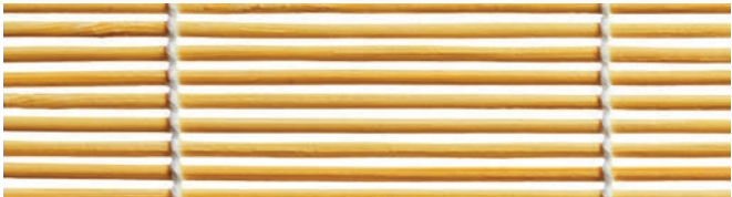
CW00 Natural NEW PG1

An interior design classic, bamboo shades gently filter sunlight with low-key natural beauty. This design features slender-grained bamboo reeds in painted tones.