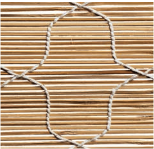
CW90 Bambosa Cream

Rough-hewn bamboo splits in their natural state are artfully hand cross-threaded with a Mughal motif in creamy threads, creating a well-traveled aesthetic. This boldly textural design not only celebrates but elevates the imperfect beauty of natural materials.