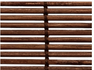
CW48 Chilean Cherry