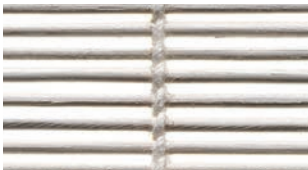
CW70 Frost PG2