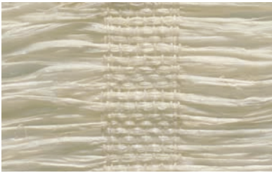
LE1803 Parchment Max Width: 120"

A relaxed timeless grassweave pattern that blends effortlessly with contemporary and traditional interiors alike. The matte finish demonstrates a natural and organic nature.