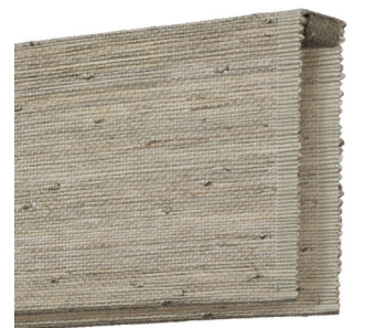
Double Valance inside mount