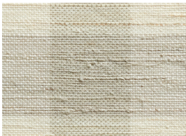
LEMH500-36 Gingham – Gray