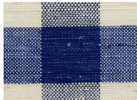
LEMH500-57 Gingham – Blue