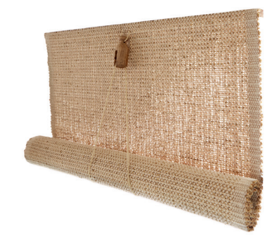
Valance with one pulley