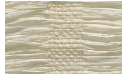
LE1803 Parchment Max Width: 120"

A relaxed timeless grassweave pattern that blends effortlessly with contemporary and traditional interiors alike. The matte finish demonstrates a natural and organic nature.