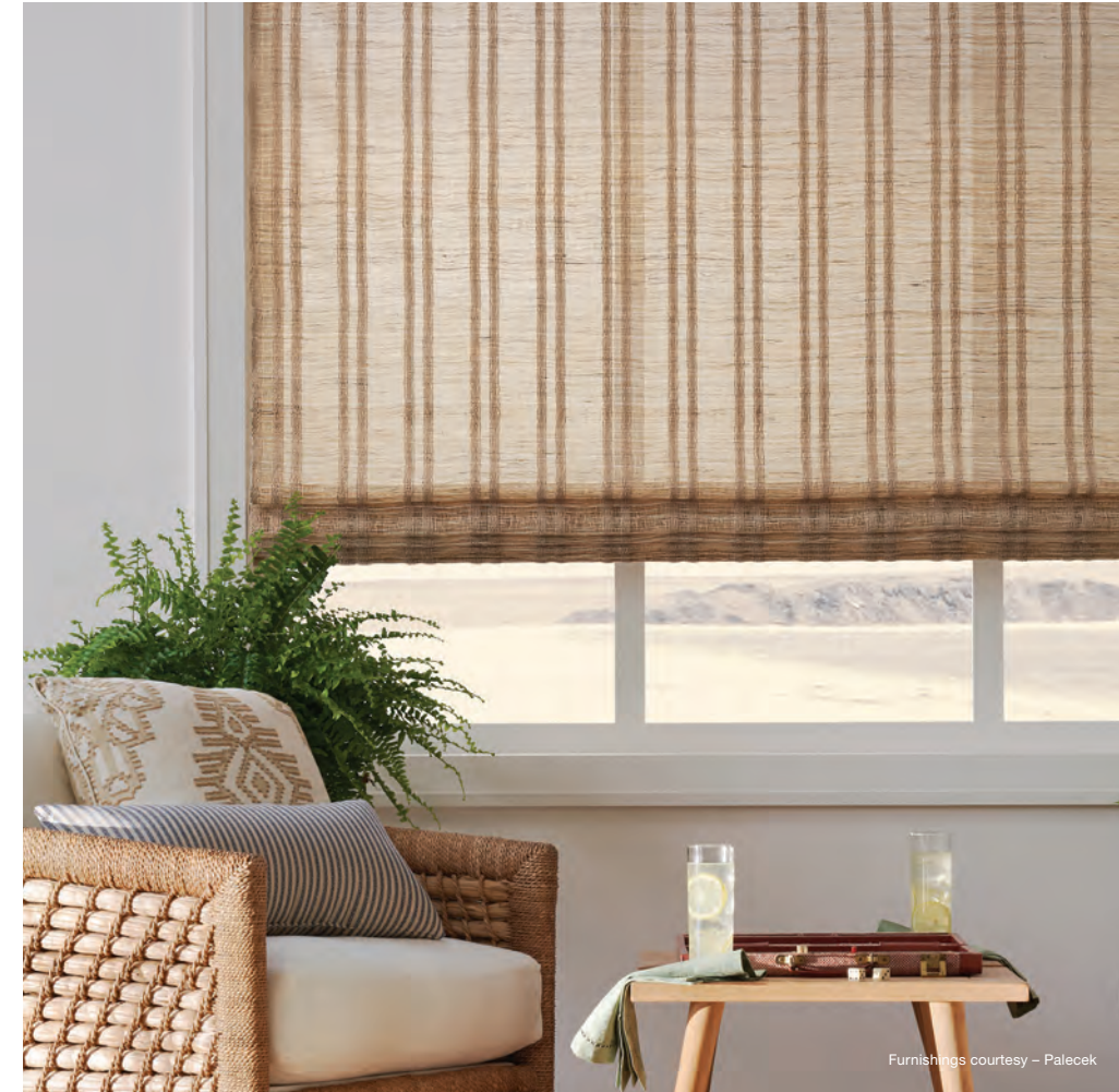
Furnishings courtesy - Palecek

Soliciting an interplay between light and fiber, this innovative warp-yarn structure and gauze-like ramie fibers candle incidental light in a graceful dramatic dance.