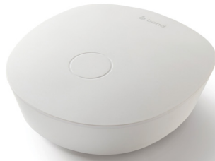
Bond Bridge Pro®