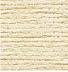
PE600-06 Sacred Desert