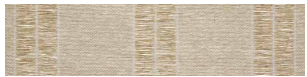
PE606-09 Conscious Beige

With a simple and understated elegance, this design connotes a rustic simplicity and stillness.