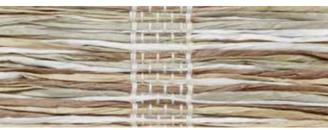
PE603-21 Blissful Bark