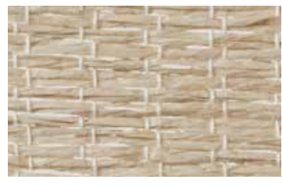
PE608-09 Common Ground