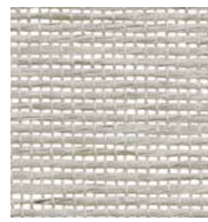
PE600-36 Placid Grey