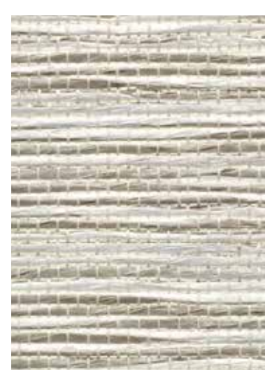
PE601-36 Soft Grey

A lightweight weave that effortlessly blends a chalky-white ground with tones of soft cream, grey or green, resulting in a heathered look that is gentle and approachable.