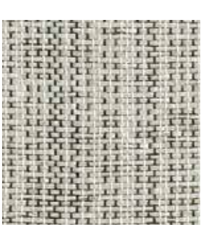
PE609-09 Reposed Sand NEW PE609-36 Insightful Grey