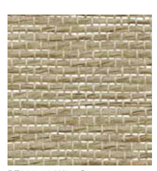
PE600-30 Wise Sage