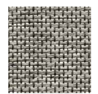
PE600-60 Steady Graphite