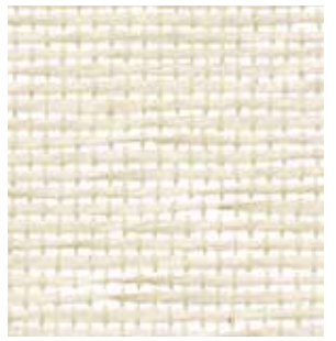
PE600-03 Pure White

This linen-like weave lends quiet sophistication to a room with its exquisite refinement. Invitingly soft and supple, it comes in an elegant spectrum of hushed neutrals from Pure White to Steady Graphite.