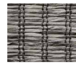
PE604-60 Vibrant Grey