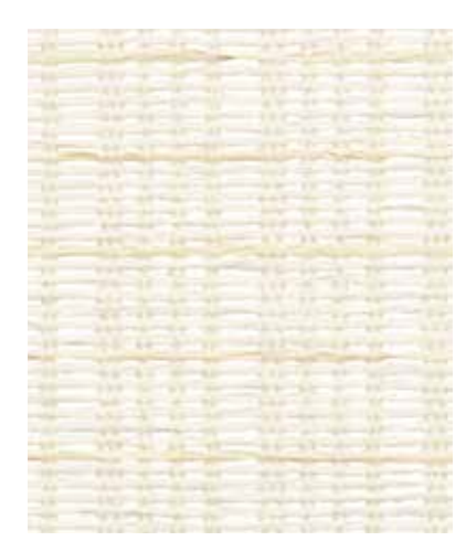
PE605-03 Cozy White

Reminiscent of Japanese screens, this open framework of line and space is created using two different colored pulp weft fibers in combination with stylized warp threading. The artistry of the weave and color selection reflects an understated, modern sensibility.