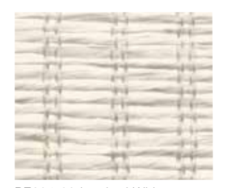
PE604-03 Inspired White