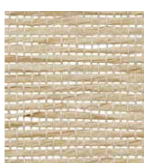
PE600-09 Serene Sand