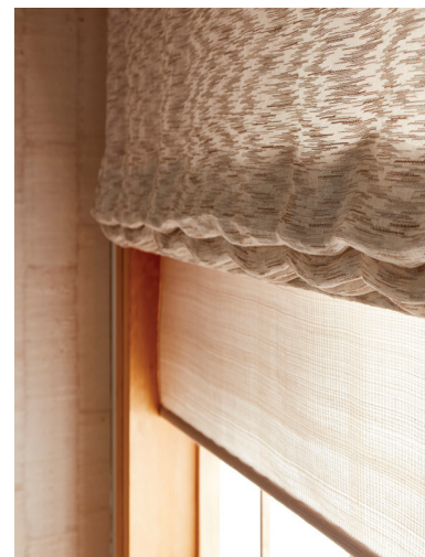
Roman | Roller Dual Shade Inside Mount