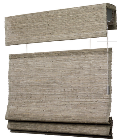
Inside Mount with Newton