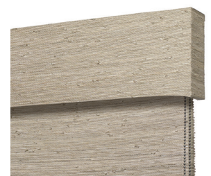
Structured Valance pxx Upgrade