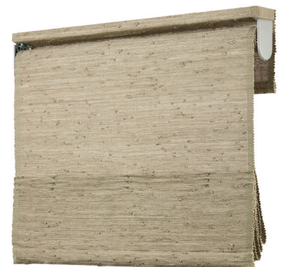
Back of Shade