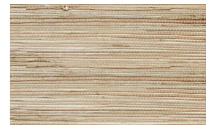
WLLK49-18G Fawn Ground

Window Price Group: 5 | Max Width: 180" Available Styles: Roman, Top Treatment