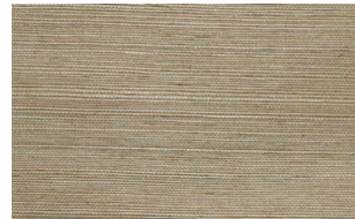
WLLK47-30G Sage Ground