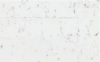
WLLK46-03G Gardenia Ground