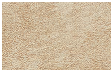
WLLK48-18G Topaz Ground