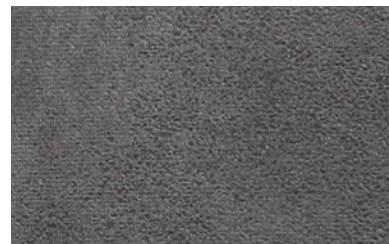
WLLK48-60G Pyrite Ground