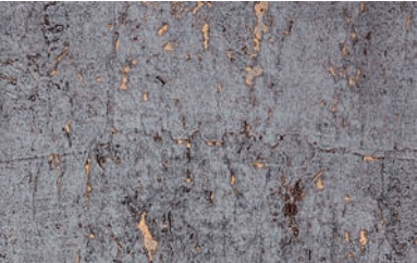
WLLK46-34G Wisteria Ground

Width: 36" (91.4cm) | Length: 8yds (7.39m)