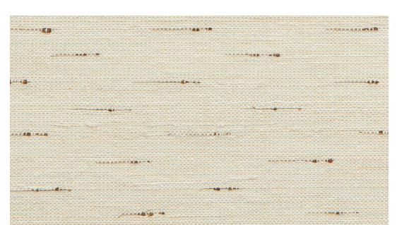
LELK40-06 Fungi – Mushroom | shown pg9