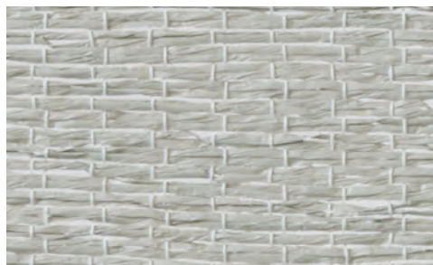
PE608-36 Gracious Grey