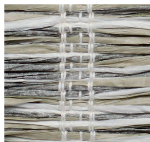
PE603-15w Kind Grey

Price Group: 4 | Max Width: 150" Available Styles: Roman, Top Treatment