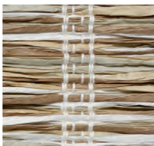
PE603-21w Blissful Bark