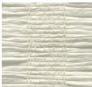
PE603-03 Calm White