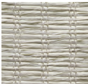
PE604-36 Contented Grey