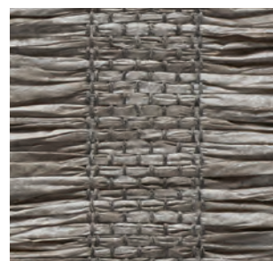
PE603-60 Tranquil Grey