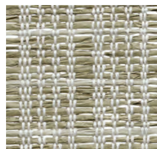
PE605-30 Easy Green