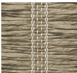
PE603-30w Mellow Green