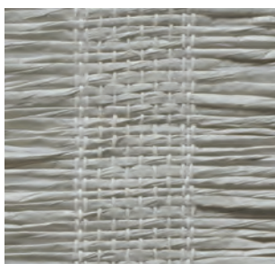
PE603-36 Sulky Grey