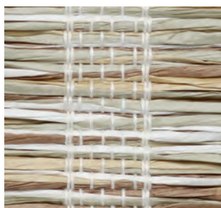
PE603-21 Blissful Bark