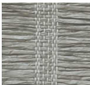
PE603-36w Sulky Grey