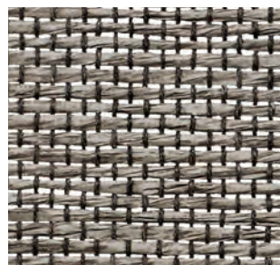
PE600-60 Steady Graphite