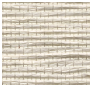
PE602-03 Divine White