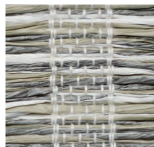
PE603-15 Kind Grey