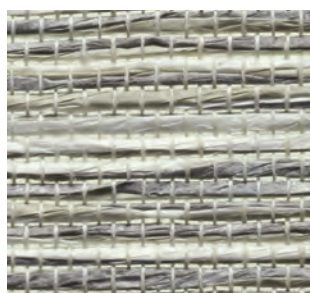
PE602-60 Diverse Grey