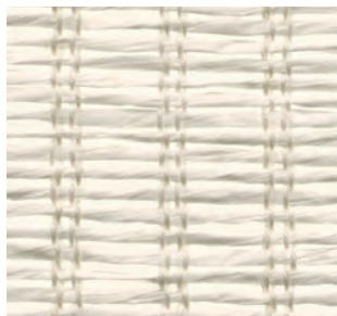
PE604-03 Inspired White

Lightweight and loosely structured, this weave filters sunlight without obscuring outside views. Delicate mottling makes the sun-bleached palette even more intriguing.