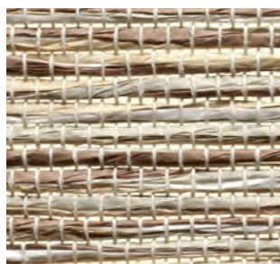
PE602-42 Infused Bark