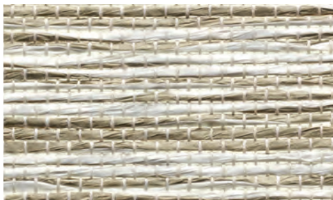
PE601-30 Gentle Green