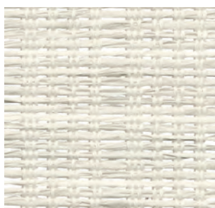
PE605-36 Passive Grey