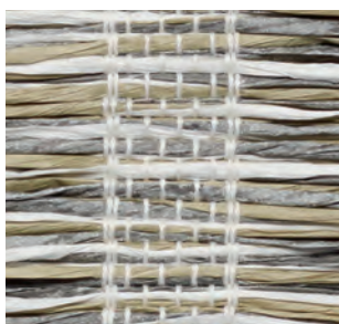
PE603-63 Warm Slate