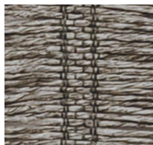
PE603-60w Tranquil Grey