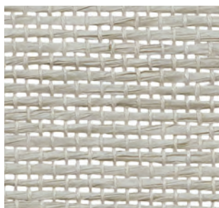
PE600-36 Placid Grey