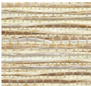
PE602-09 Blended Raffia