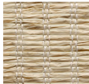
PE604-09 Relaxed Sand