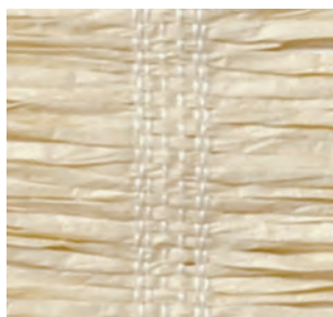
PE603-06w Mindful Ivory