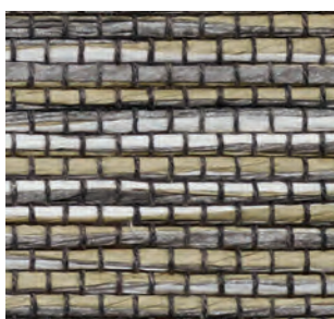
PE602-63 Noble Slate