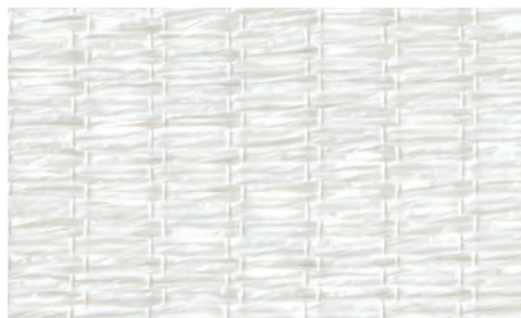
PE608-03 Peaceful Dove