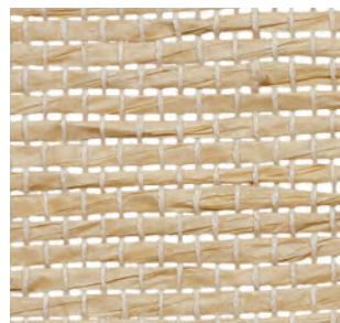
PE600-09 Serene Sand