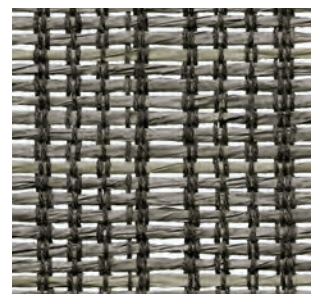
PE605-60 Cool Grey