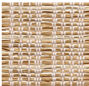
PE605-09 Quiet Beige