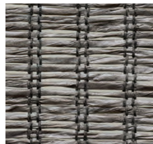
PE604-60 Vibrant Grey