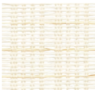
PE605-03 Cozy White