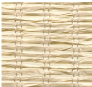
PE604-06 Restful Ivory