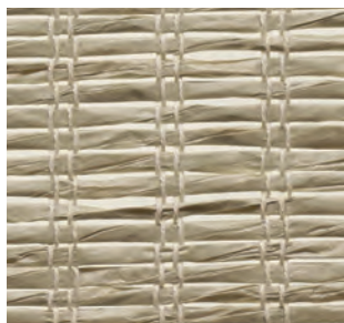
PE604-30 Peaceful Green