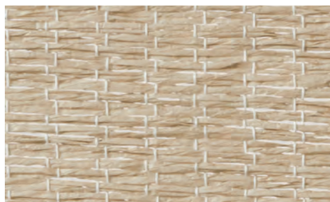
PE608-09 Common Ground