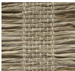
PE603-30 Mellow Green