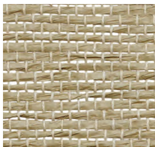
PE600-30 Wise Sage