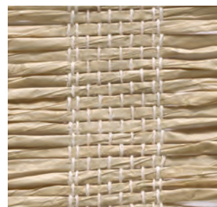
PE603-09 Creative Sand