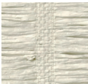
PE603-03w Calm White