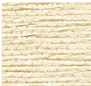
PE600-06 Sacred Desert