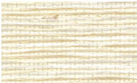
PE601-06 Soothing White