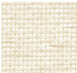
PE600-03 Pure White