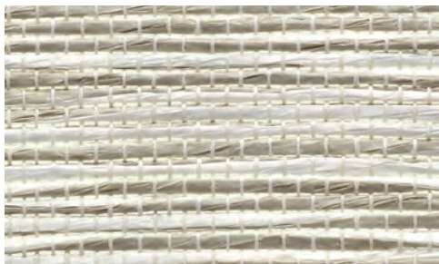
PE601-36 Soft Grey