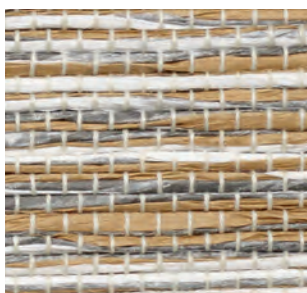
PE602-51 Healing Agate