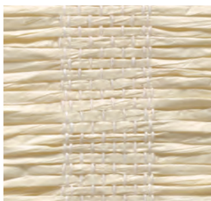
PE603-06 Mindful Ivory