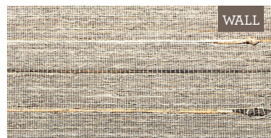
WL359 Mojave - High Desert

To order no-charge memos, contact Customer Relations at 888.582.8780 or your local showroom representative.