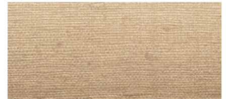
EW41L Lantau Drapery