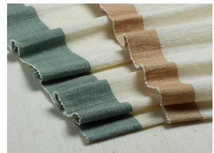
Custom Warp Edge Width Options