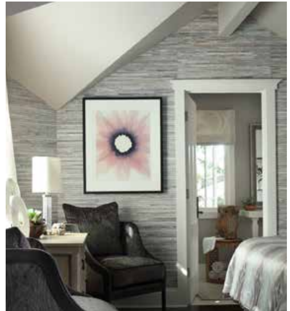
Designer: Tish Mills